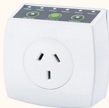
BNH-50/SA76 Repeat Countdown Timer, IP20

48 ON/OFF per day Without indicator With switch knob Min. Setting time: 15 minutes Max. Setting time: 24 hours 240V~, 50Hz, 10A