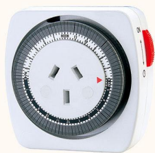
BND-50/A5 24 Hour Mechanical Timer, IP20

48 ON/OFF per day Without indicator With switch knob Min. Setting time: 15 minutes Max. Setting time: 24 hours 240V~, 50Hz, 10A