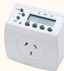
BND-50/SA2 Weekly Digital Timer, IP20

6 program options Countdown time: 15 minutes/30 minutes/1 hour/ 2 hours/4 hours/6 hours With manual ON/OFF function With repeat function 240V~, 50Hz, 10A